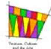
Tradition, Culture and the Arts